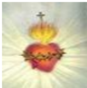
Feast day JUNE 16 th , 2023