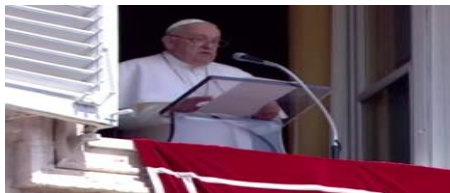
Pope on Assumption: The Blessed Mother leads us toward eternal life

Pope on Assumption: The Blessed Mother leads us toward eternal life - Vatican News