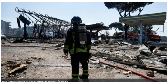
The explosion of a gas station in Rome.