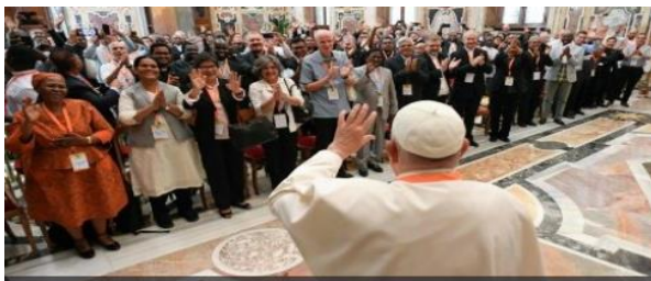
Pope meeting with the Missionaries of the Divine Word