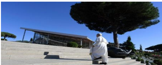
Pope: Building the 'civilisation of love' requires courage and humble leadership

To read more, click this link >>> Pope in Tenerife: Open Christ's 'Ocean of Love' - Vatican News