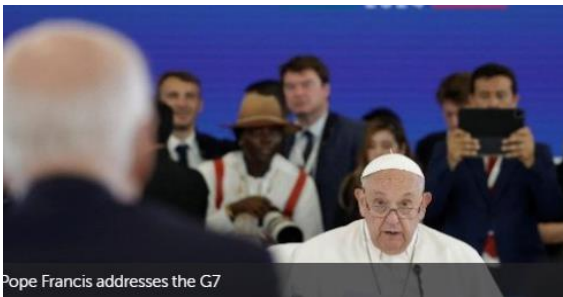
Pope Francis addresses the G7