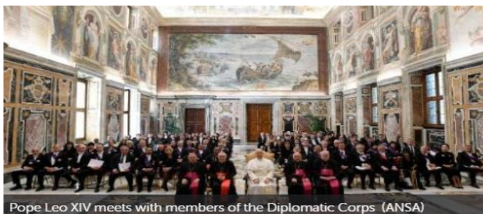
Pope Leo XIV meets with members of the Diplomatic Corps

To read more, click this link >>> Pope to Diplomatic Corps: Build peace with justice, truth, and hope - Vatican News