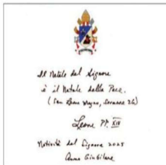
The Pope's Christmas card

On Tuesday, December 23, in responding to journalists' questions outside Villa Barberini in Castel Gandolfo, Pope Leo asked people of goodwill for "that, at least on the feast of the birth of the Saviour, one day of peace may be respected." That same "unarmed and disarming" peace he invoked when he first appeared at the Central Loggia of St. Peter's Basilica on May 8th, shortly after being elected as Pope.