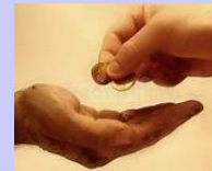
GIVING & SHARING