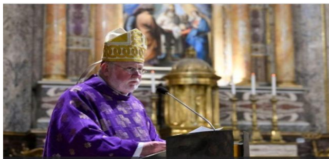
Archbishop Gallagher celebrates Mass at the Church of the Gesù