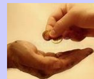
GIVING & SHARING