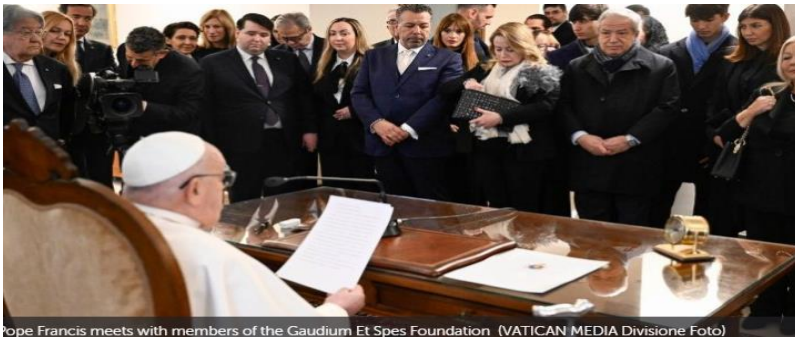
Pope Francis meets with members of the Gaudium Et Spes Foundation