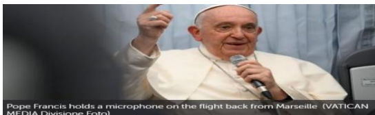
Pope Francis holds a microphone on the flight back from Marseille.