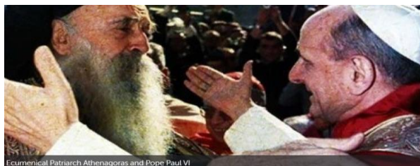
Ecumenical Patriarch Athenagoras and Pope Paul VI