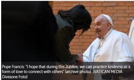
Pope Francis: "I hope that during this Jubilee, we can practice kindness as a form of love to connect with others" (archive photo)