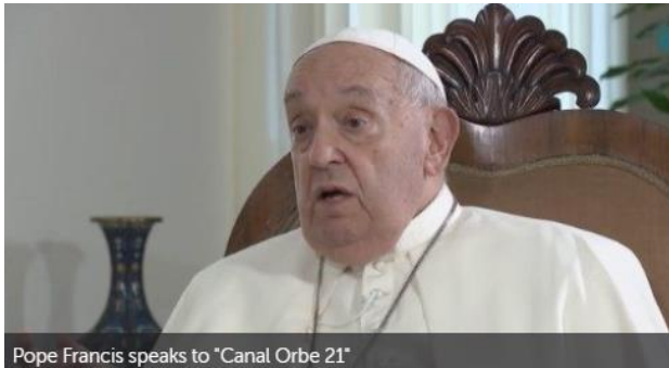
Pope Francis speaks to "Canal Orbe 21"