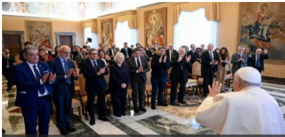
Pope Francis meets with a delegation from the University of Naples Federico II.